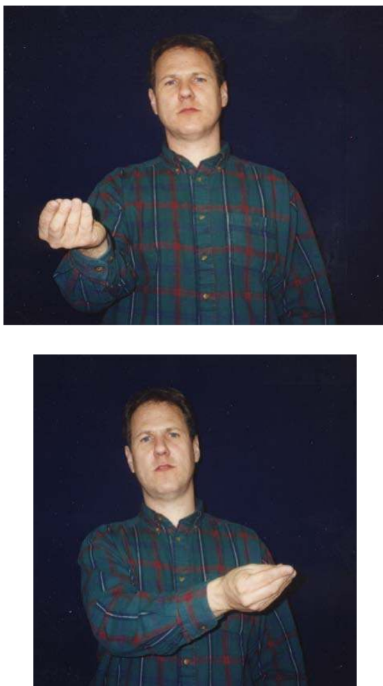
Figure 2. Start and end positions of GIVE with a definite object (© Bahan, from Bahan 1996.)