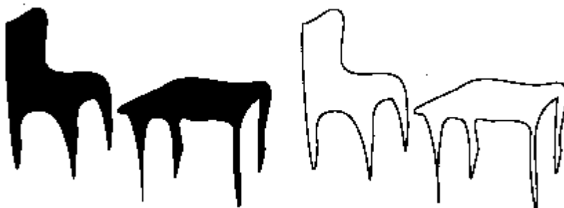
Fig. 1 : An image and its edges