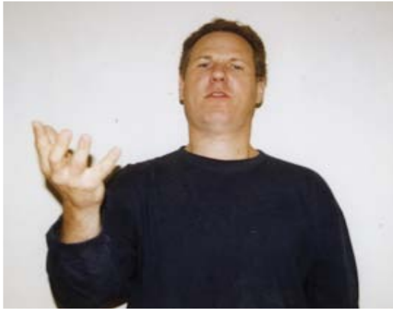
Figure 3. End position of GIVE with an indefinite object (© Bahan, from NBMLK 1998.)

In addition to receiving manual expression, agreement features may also be expressed non-manually via head tilt and eye gaze. These non-manual agreement markings are essentially optional, although they occur quite frequently. In transitive clauses, head tilt marks subject agreement whereas eye gaze expresses agreement with the object. In intransitive clauses, head tilt and/or eye gaze may mark agreement with the sole argument. We have argued that these non-manual agreement markings — which ‘point’ to the same spatial locations that are used for manual subject and object agreement inflection — are expressions of abstract agreement features located in the heads of functional agreement projections. The examples that follow illustrate non-manual markings of agreement in transitive clauses (with both agreeing and plain verbs) and intransitive clauses 15 .