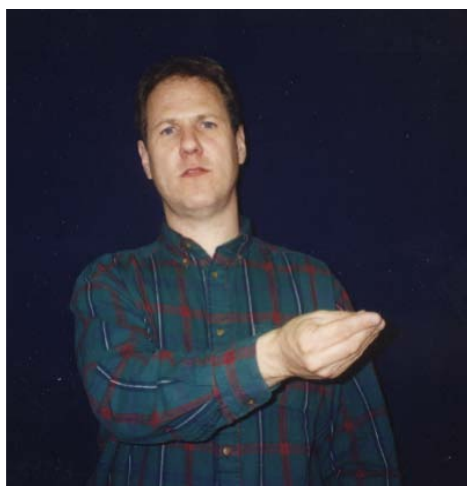
Figure 2. Start and end positions of GIVE with a definite object (© Bahan, from Bahan 1996.)